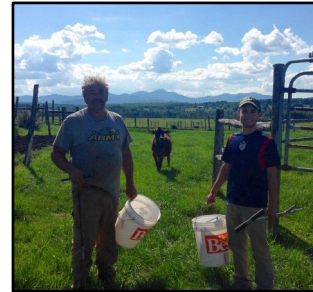
Local farmer & staff soil sampling