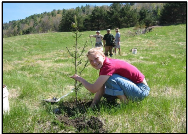
Student planting trees on the Black River

Riparian buffers are vegetated areas adjacent to rivers and streams that are integral to healthy river ecosystems.